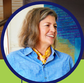
Art by Northwest