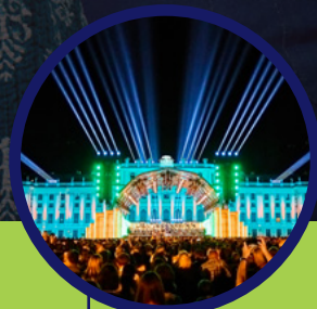
Vienna Philharmonic Summer Night Concert