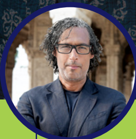
Empire: The World's First Superpower